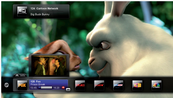
Picture-in-picture in channel surfer

A good user interface (UI) can be the differentiating factor when it comes to the TV experience. With over 10 years' experience in designing and developing user interfaces for operators worldwide, mirada is well equipped to bring you the most compelling digital TV service.